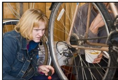
Bike Kitchen-Pepe Fierro 1720 South 15th St