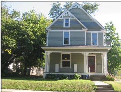
Wamsley 1721 Garfield St