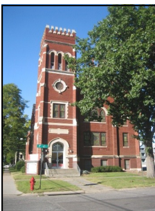
St Paul UCC Farmers' Market 1302 F St