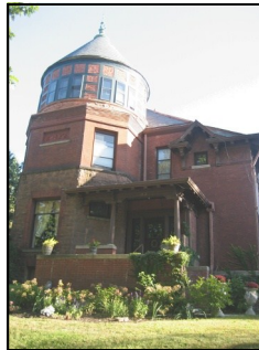
Brammeier 1937 F St