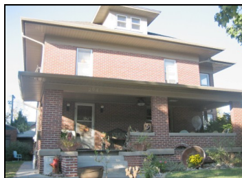
Phelps 2648 Washington St