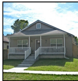
Shriner 2607 Garfield St