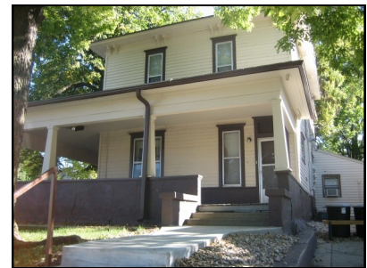
Lynn Fisher 2145 A St