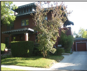
Bryant/Bauman 2035 B St