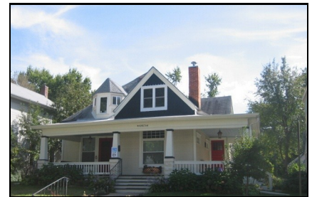
Knight 1917 Prospect St