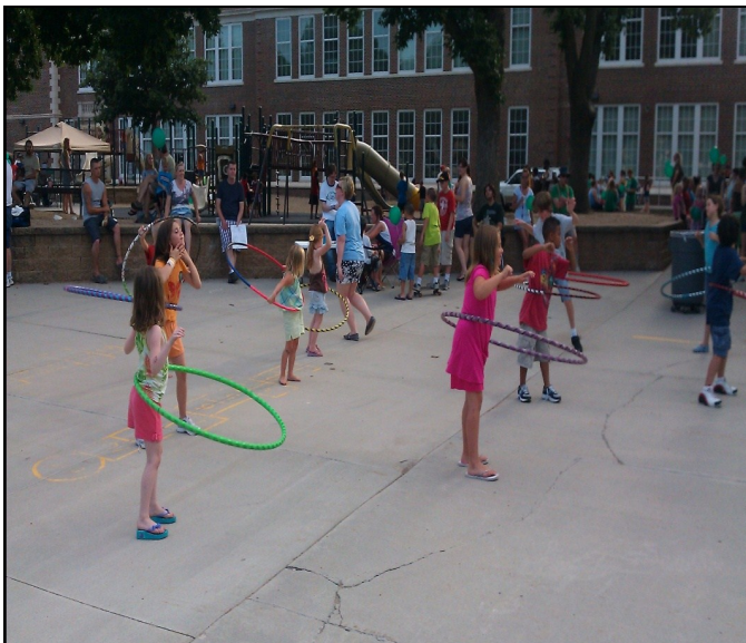
Children at play in Prescott Park during Prescott's Summer Festival